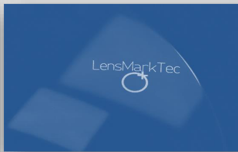
Engraving intensity variations